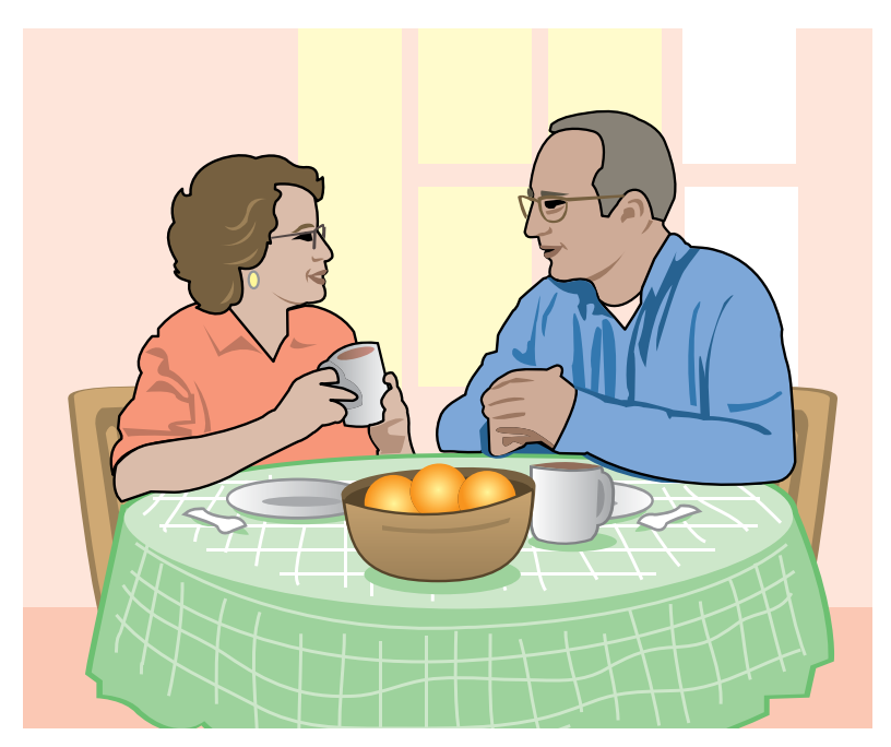
Eating well may help you feel better.