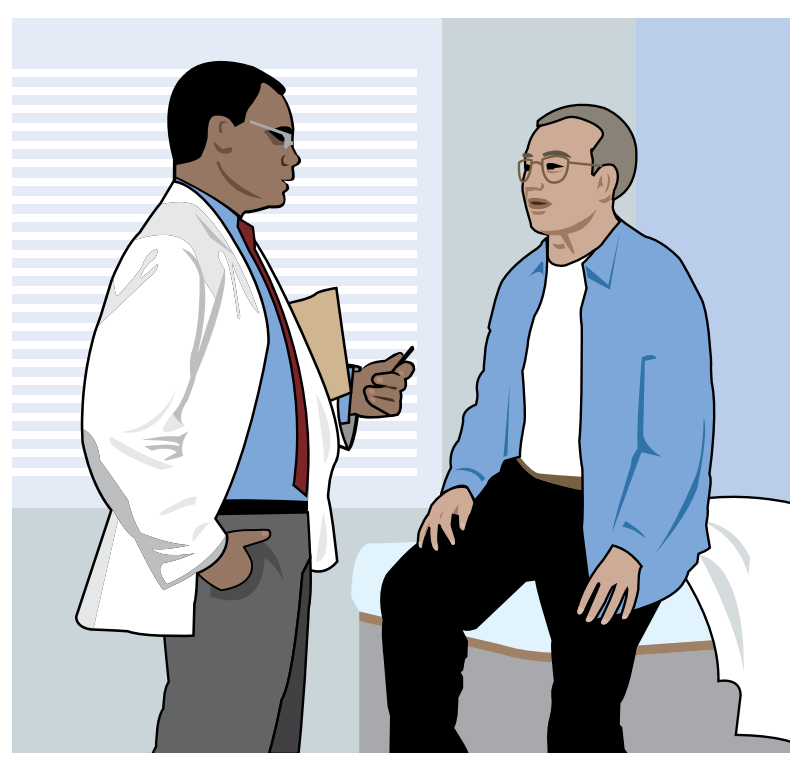
You may want to get a second opinion before starting treatment.