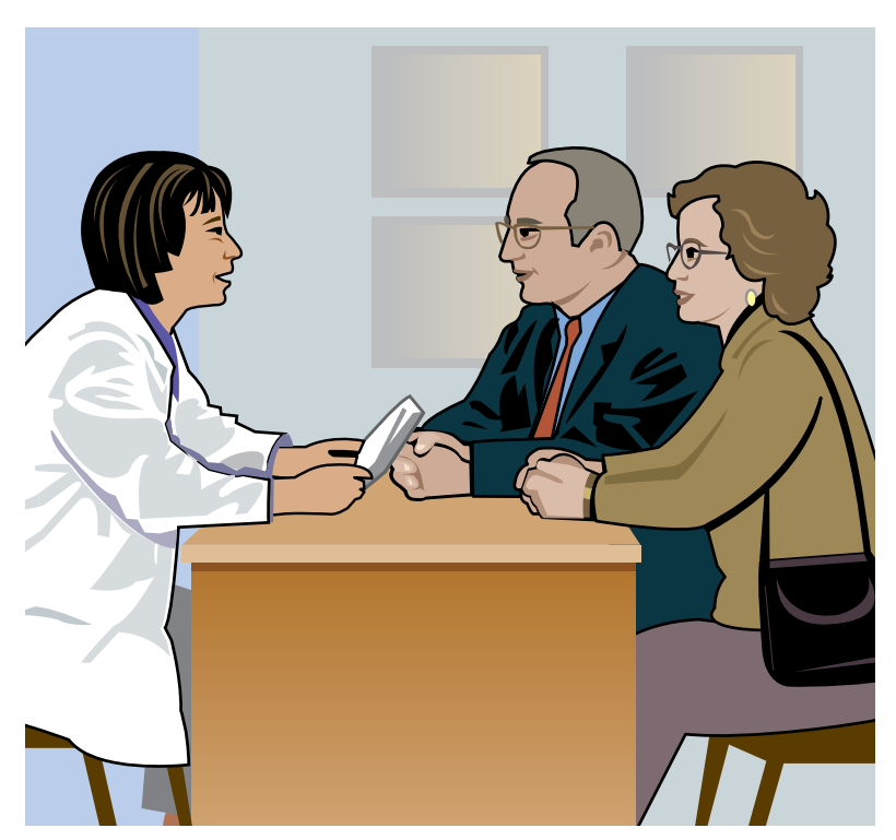
You and your doctor will develop a treatment plan.